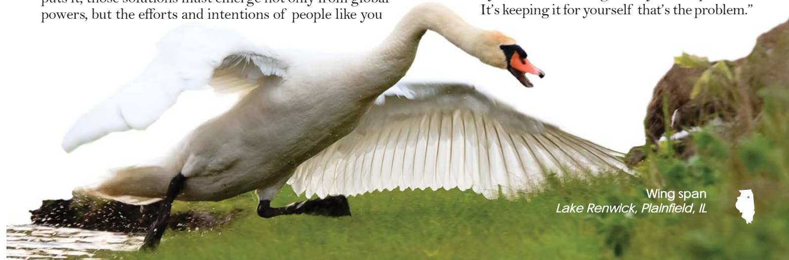
Wing span Lake Renwick, Plainfield, IL

It’s keeping it for yourself that’s the problem.”